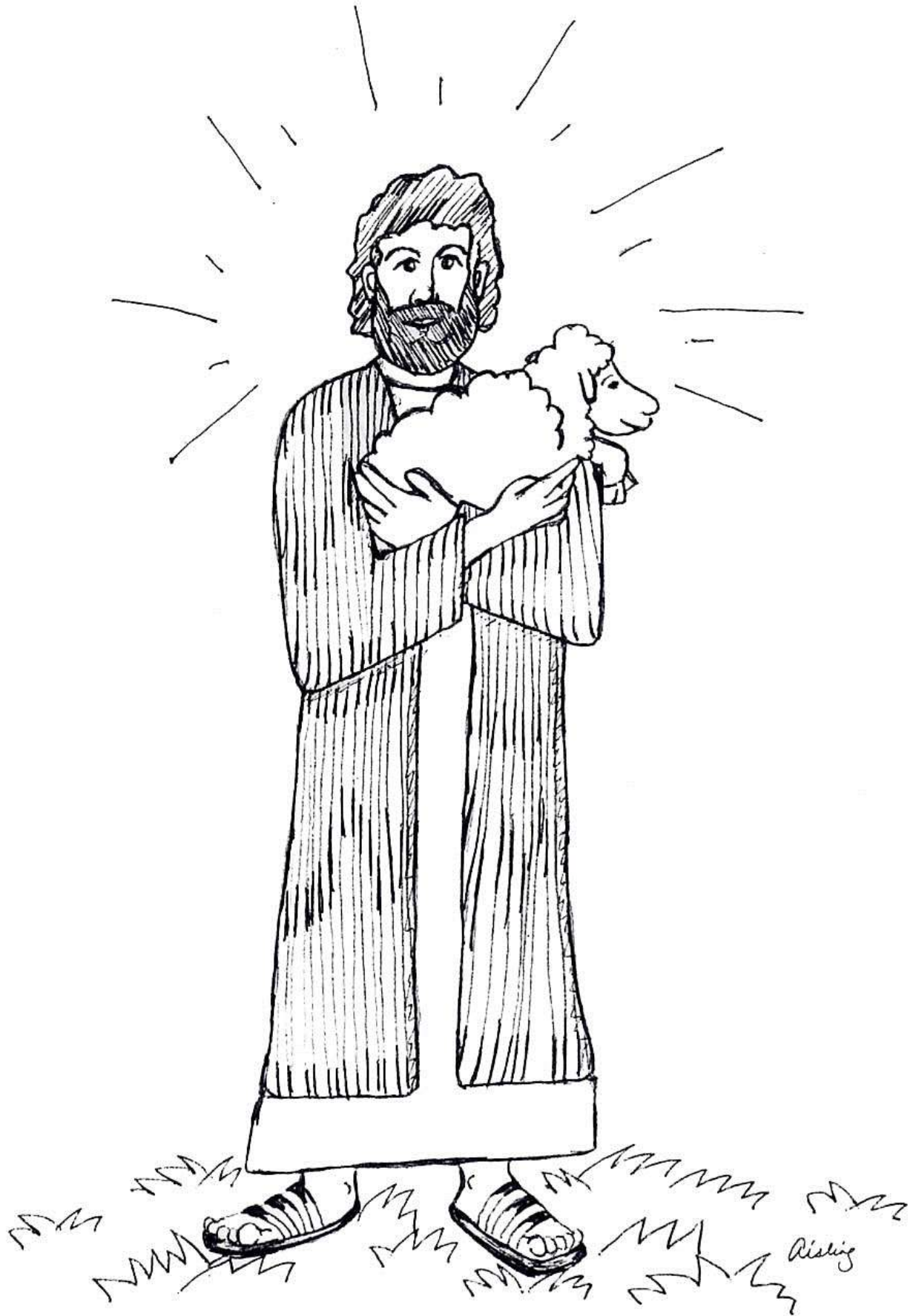
Jesus the Good Shepherd