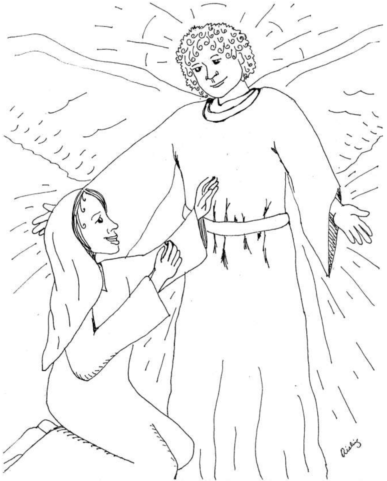
Mary and the Angel